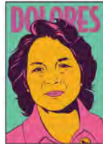
DOLORES HUERTA FOUNDATION